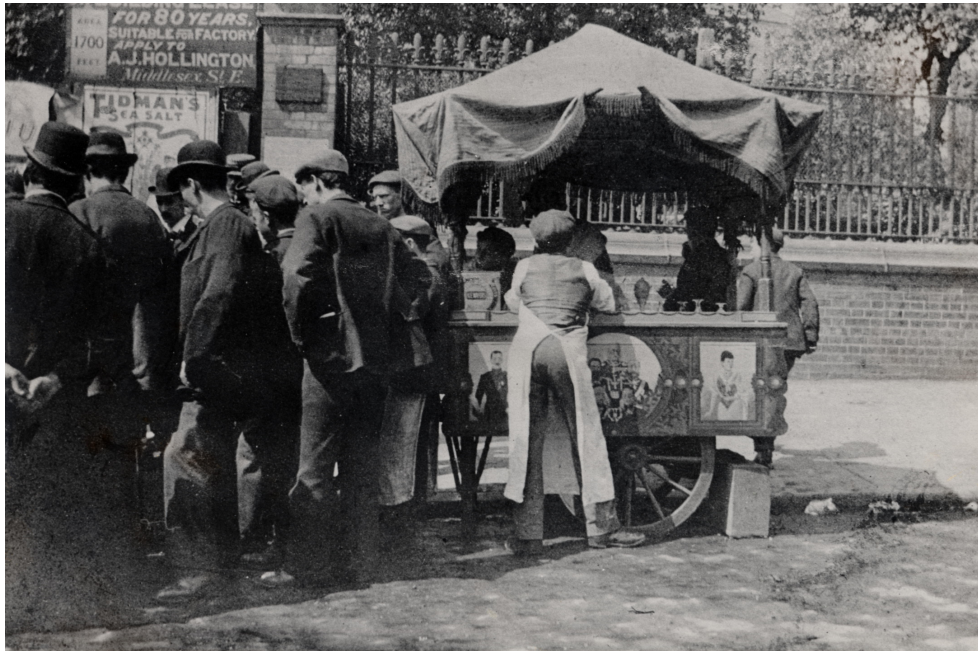
An Italian ice cream seller in Clarks Green, c.1900

Like hot chocolate, ice cream was already popular in Europe, but it was expensive to make because refrigeration had not been invented. Gatti, and other ice-cream sellers like him, would have used a mixture of ice and salt to cool the ice cream mixture. It needed to be stirred constantly to stop it freezing hard. It was hard work, but luckily for Gatti, he could get ice easily from the Regent's Canal ice wells.