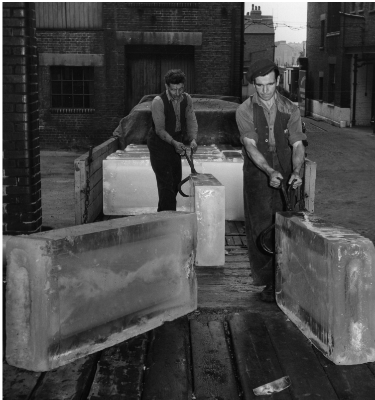
Transporting ice from Norway.

The ice was cut from natural lakes in Norway during spring time. It was then transported, mostly to London, by ship. It was important that ships were fast to prevent the ice melting too much. The ship's crews would race each other and bets were placed on who would set the fastest time.