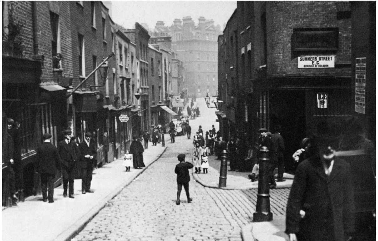
Saffron Hill, in Little Italy, c1900. Saffron was grown here in the middle ages, it was added to food to hide the taste of rotten meat!