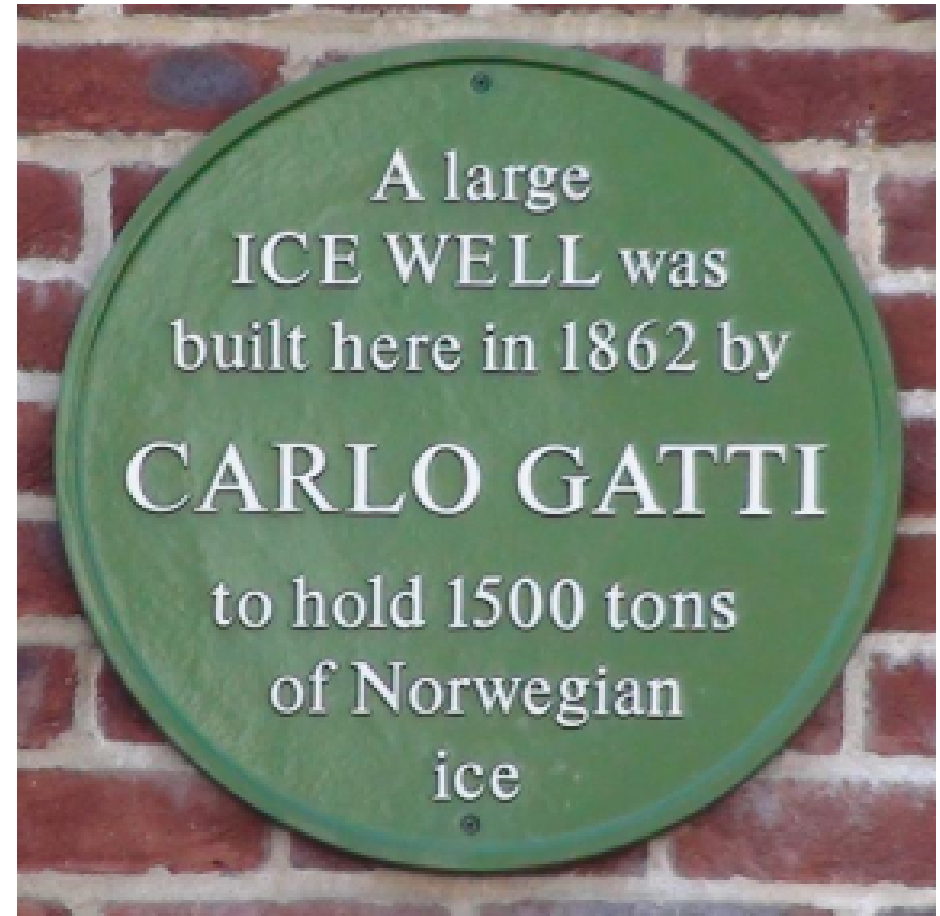
Above: Plaque marking the location of Gatti's Caledonian Road ice well Left: A typical day at the Metropolitan Cattle Market

The Metropolitan Cattle Market – This cattle market replaced Smithfield as London's live meat market. It was the largest market of its kind in Britain. With thousands of animals sold and slaughtered everyday, the market needed a good supply of ice. The Cally Clock Tower is the only reminder of the market that can still be seen today.