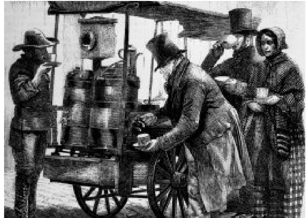
A typical Victorian coffee stall

In 1851 Gatti and Bolla exhibited their chocolate making machine in the Great Exhibition at Crystal Palace, where Queen Victoria herself described it as a very curious machine.